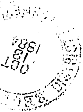
Exhibit taken on the 11th day of October 1884 before